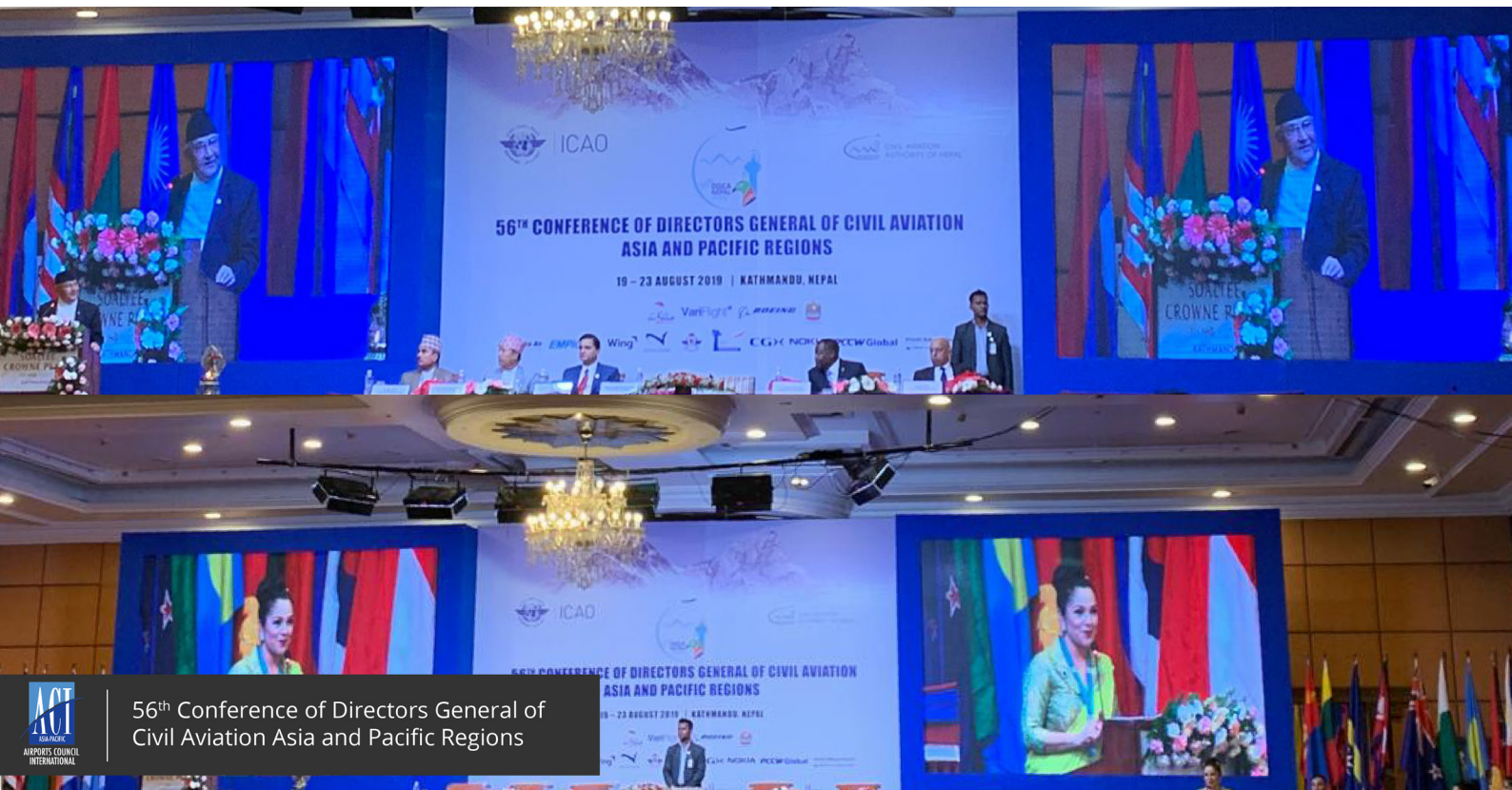
56th Conference of Directors General of Civil Aviation Asia and Pacific Regions

ACI attended the ICAO 56th Conference of Directors General of Civil Aviation (DGCA), Asia and Pacific Meeting on 19 – 23 August in Kathmandu, Nepal. The theme of this year's conference was "Harmonizing Efforts to Meet the Capacity Constraints".